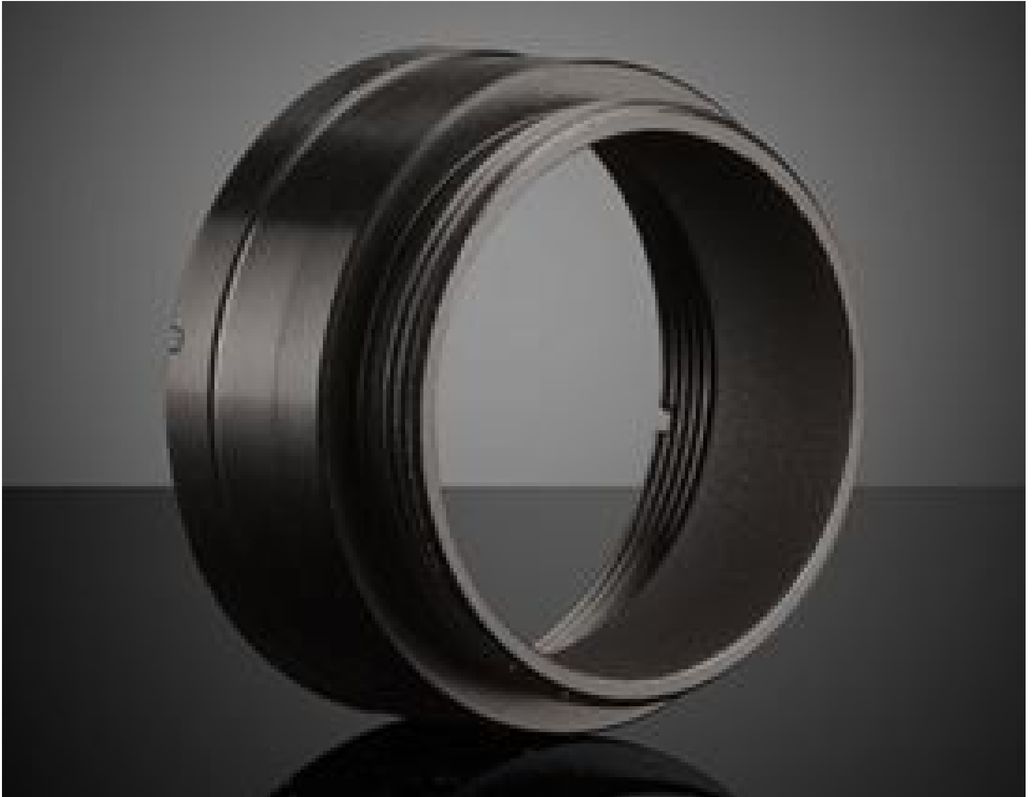
Mitutoyo Objective Adapter (M26 x36TPI), #89-904