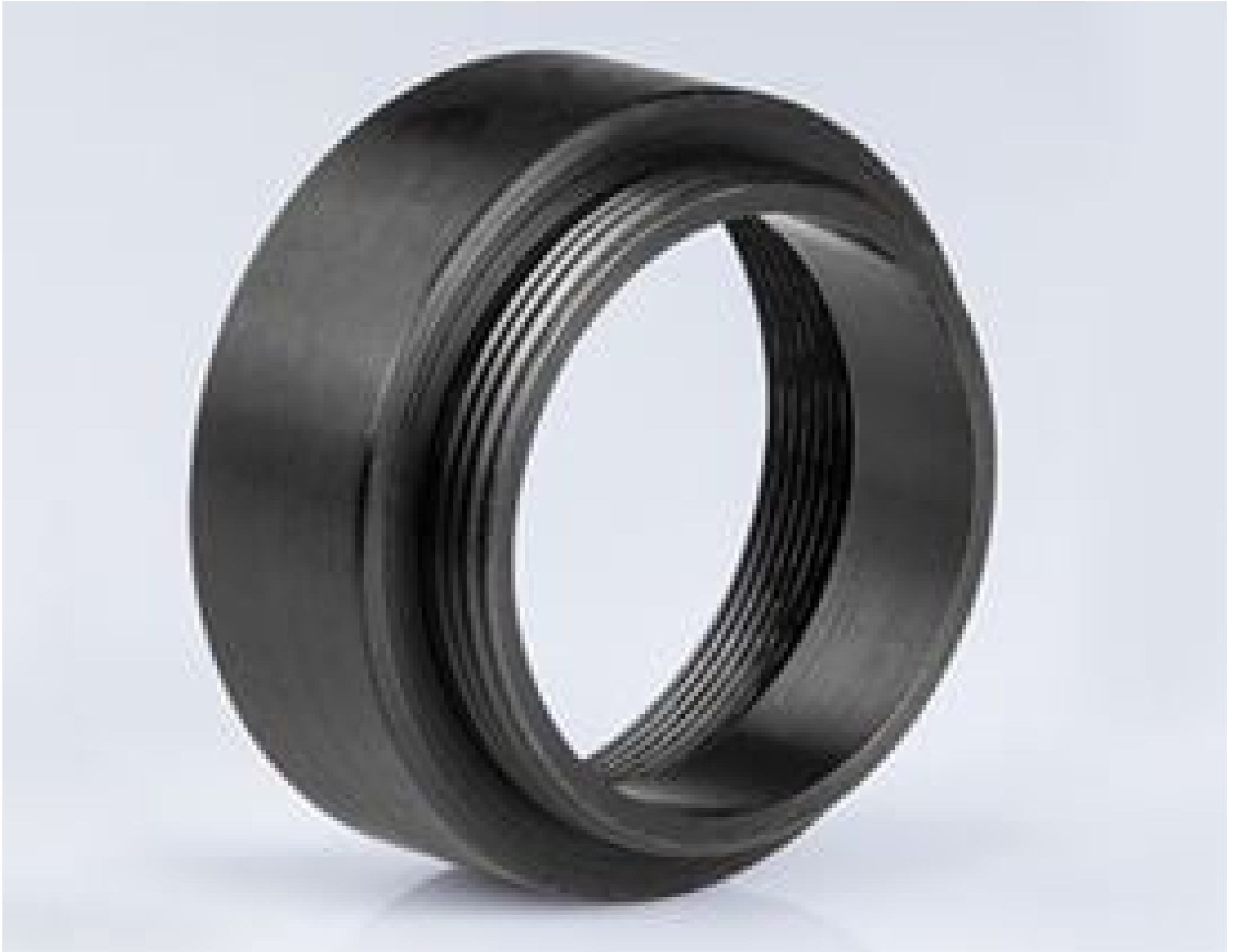
Mitutoyo to C-mount 10mm Adapter, #55-743