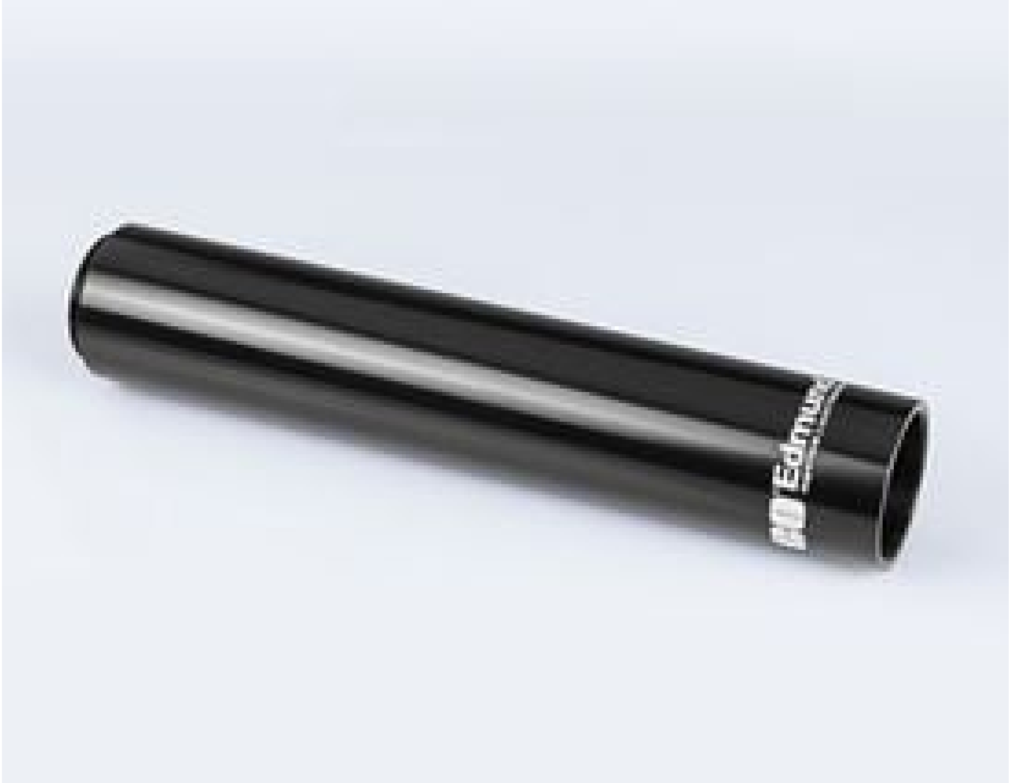
Mitutoyo to C-mount Camera 152.5mm Extension Tube, #56-992