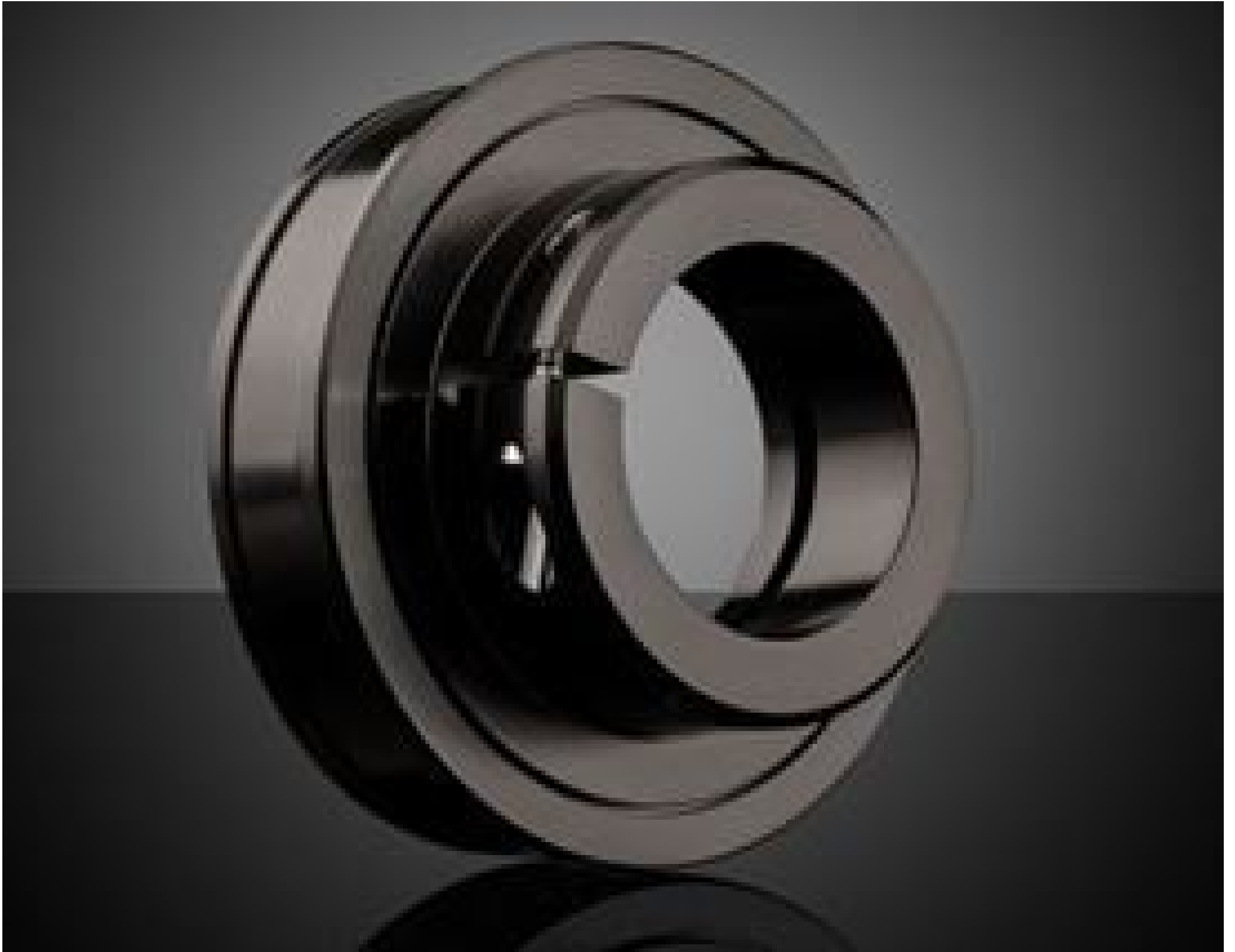
Microscope Stand Mounting Clamp