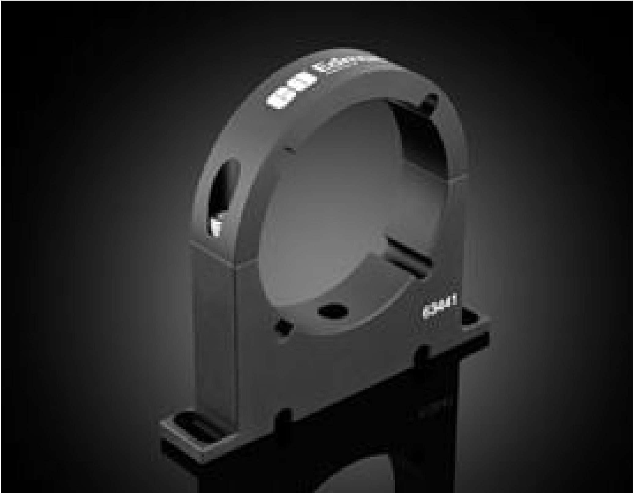
#63-441: Mounting Clamp, 90mm Inner Diameter