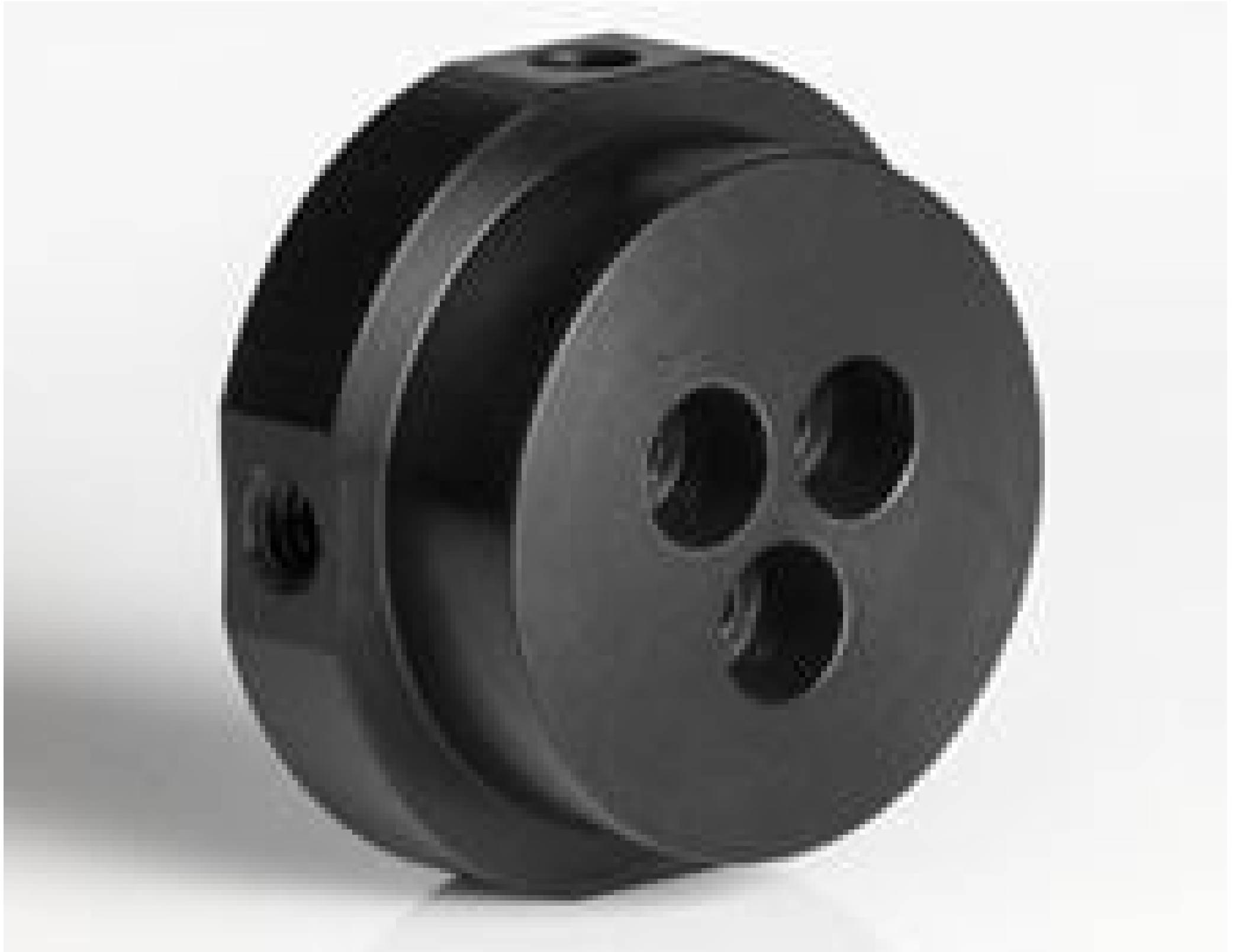
Mounting Plate for 12.7mm Diameter Off-Axis Mirrors, #34-425