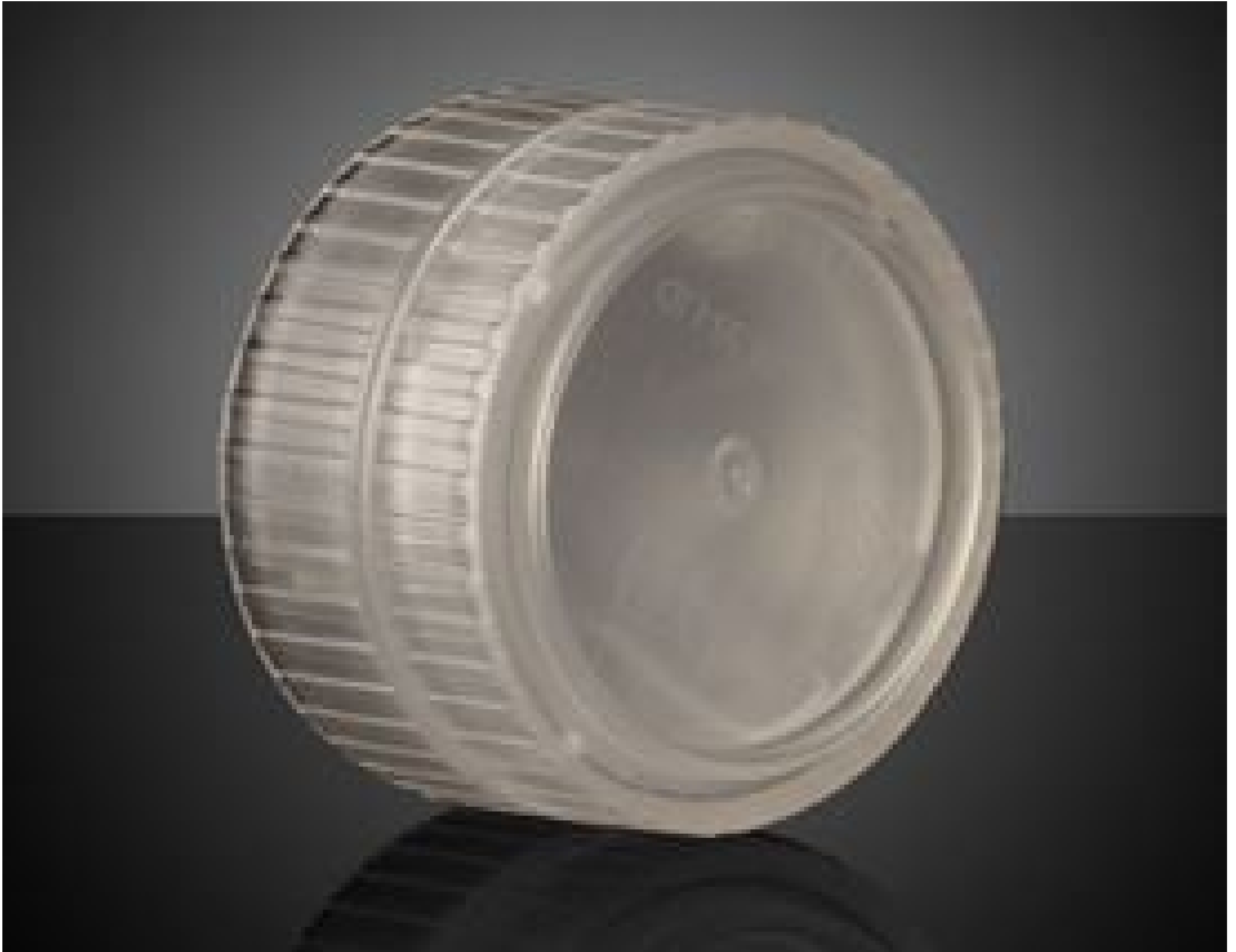
Non-Contact Impact Case for 19.1 Dia. x 6.35mm Thick Optics