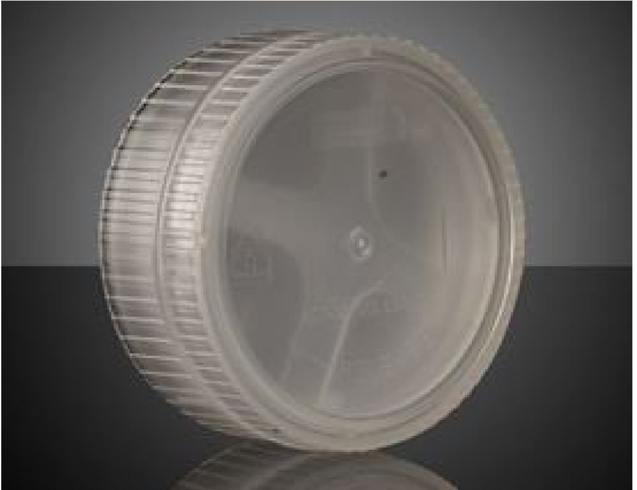
Non-Contact Impact Case for 38.1 Dia. x 9.53mm Thick Optics