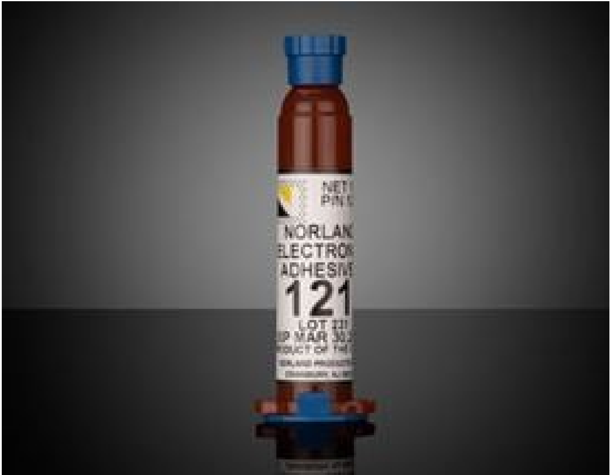
Norland Electronic Adhesive NEA 121, 10cc Dispensing Barrel