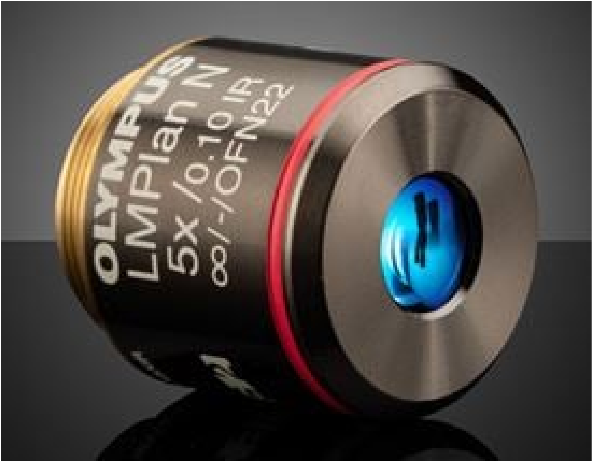
Olympus LMPLN5XIR 5X NIR Objective