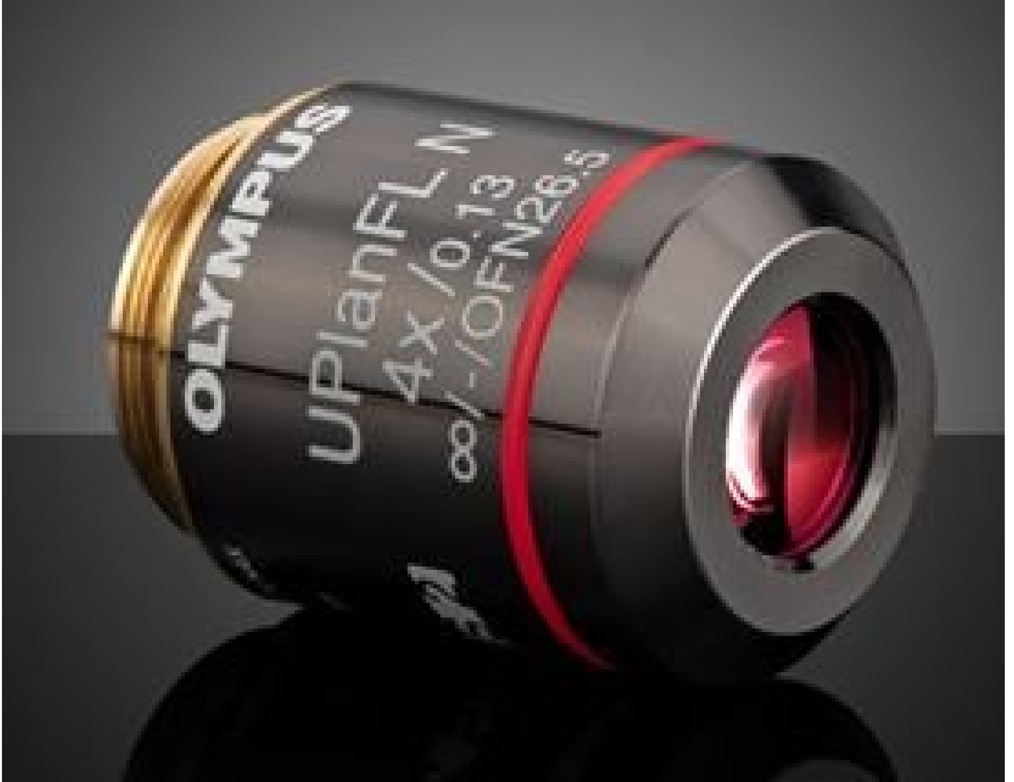
Olympus UPLFLN 4X Objective