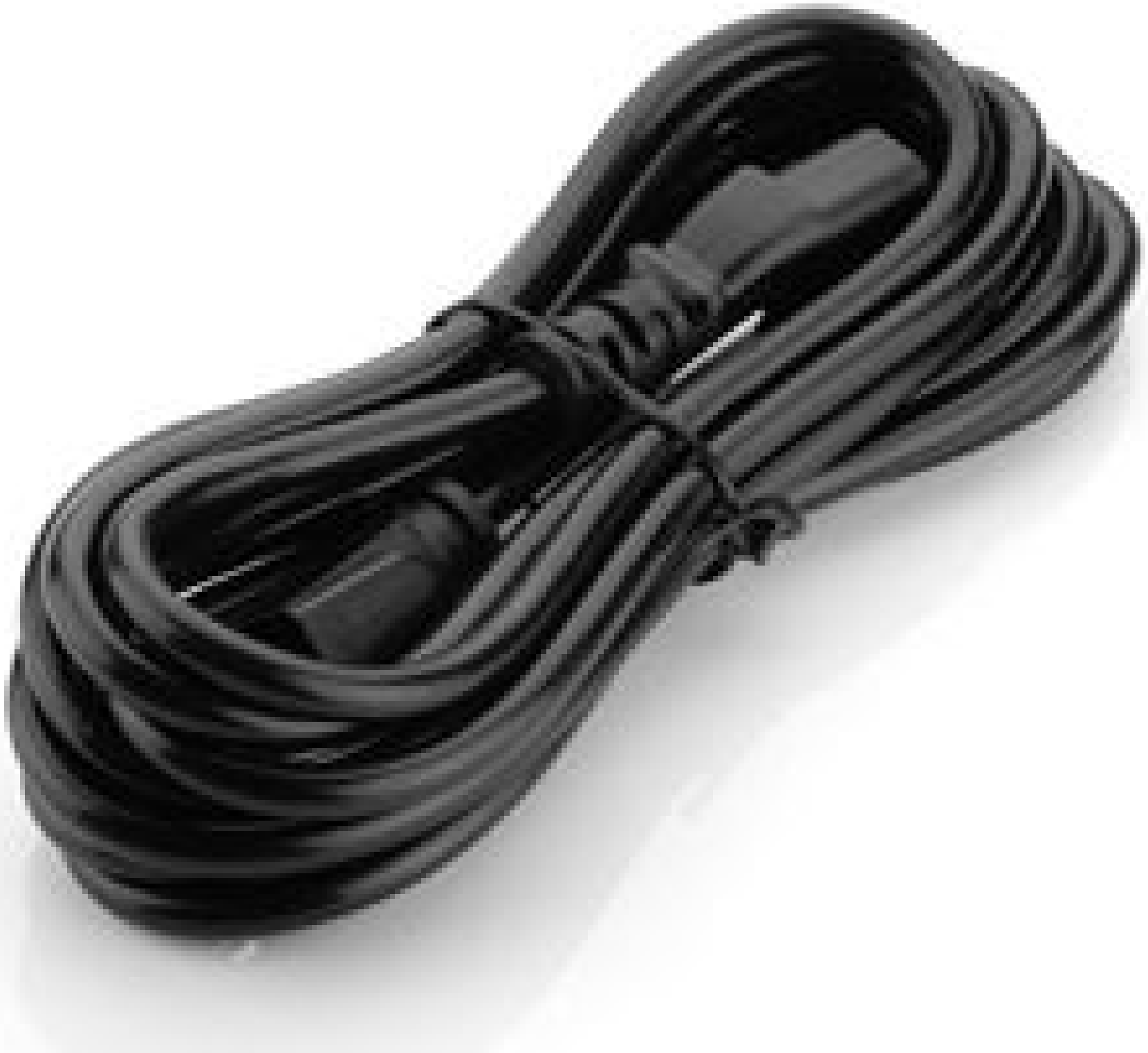
Power Cord for MFC-200 Power Supply (120V)