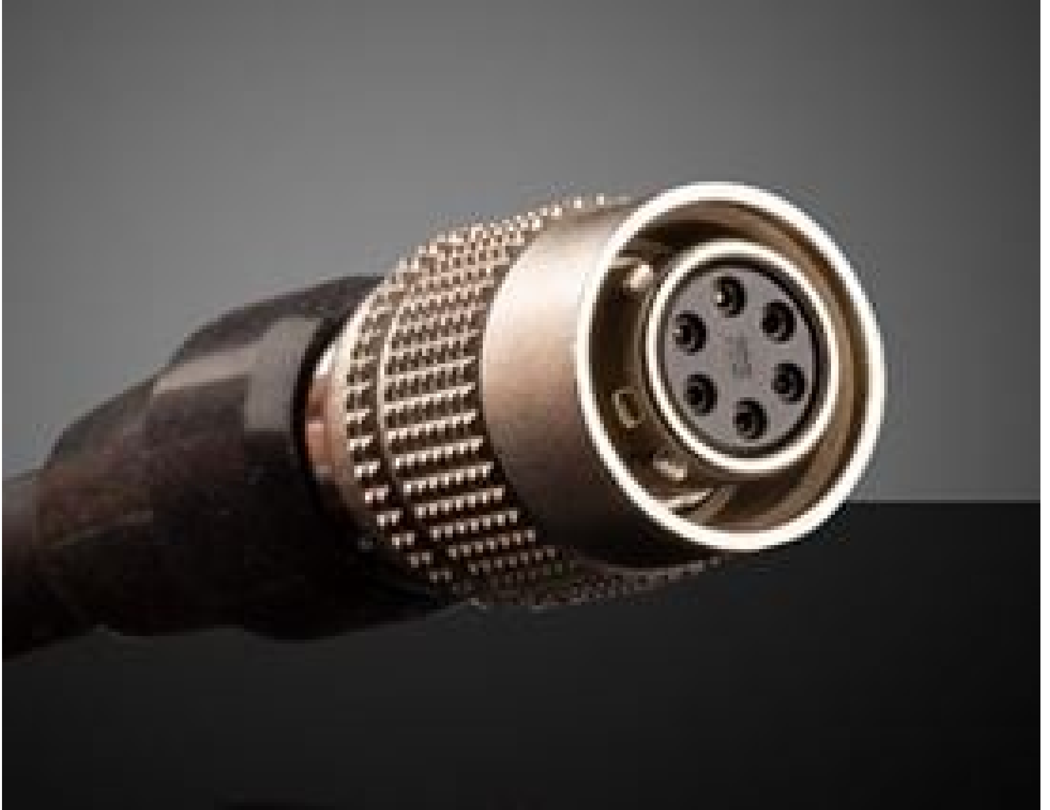
Power Supply 12VDC / Hirose 6 Pin, #68-466