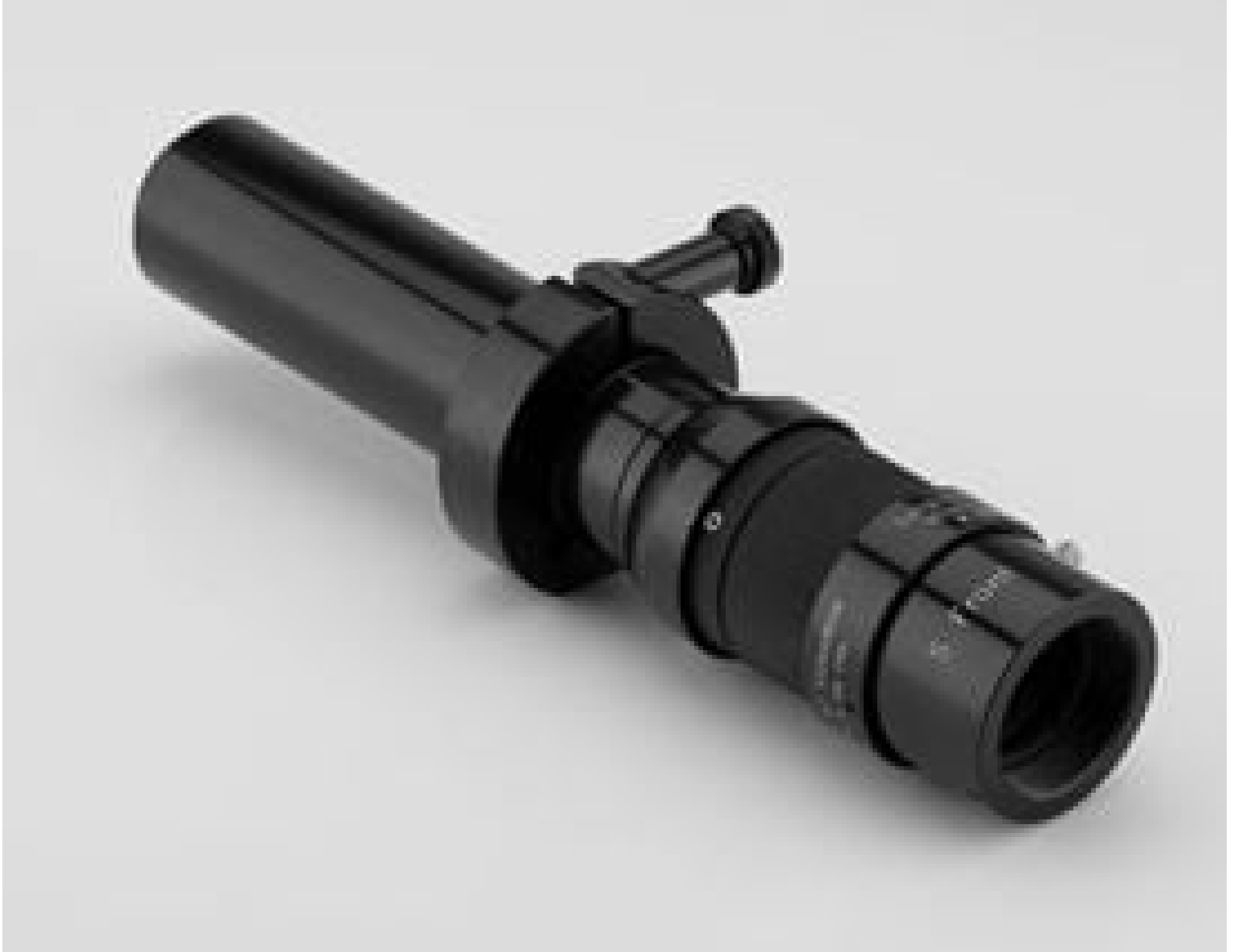
#86-889: S Main Body, C-Mount, KC VideoMax