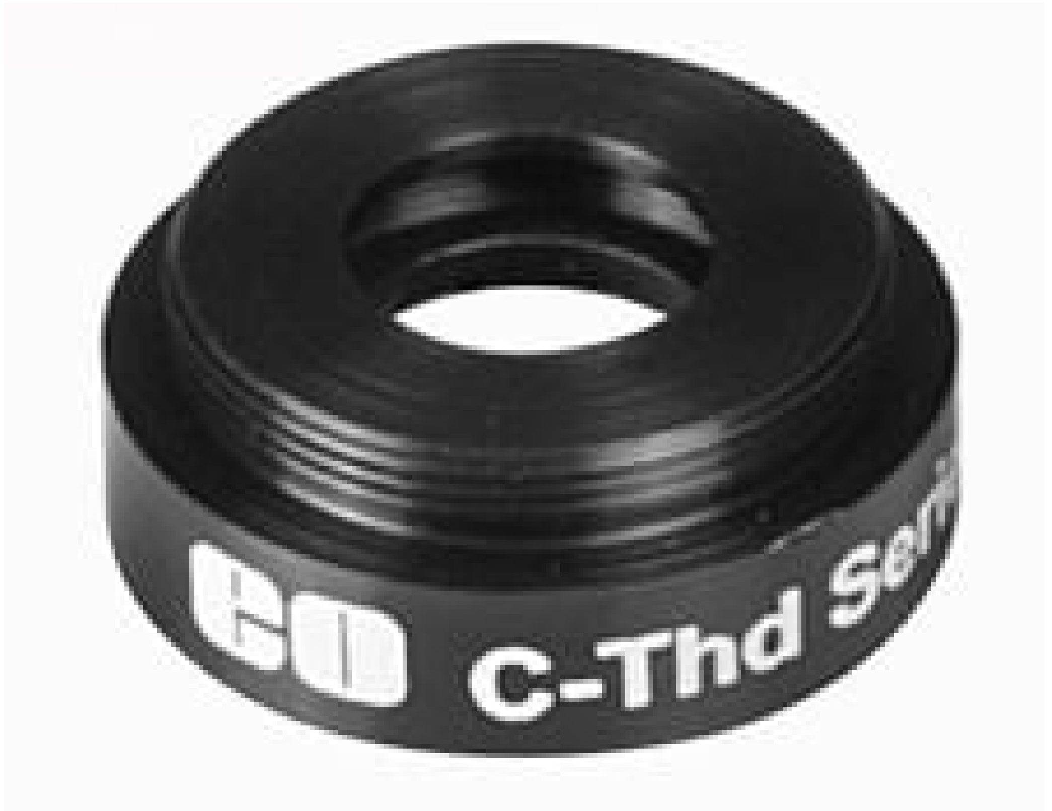
C-Mount to TO-8 Detector Mount, #58-733