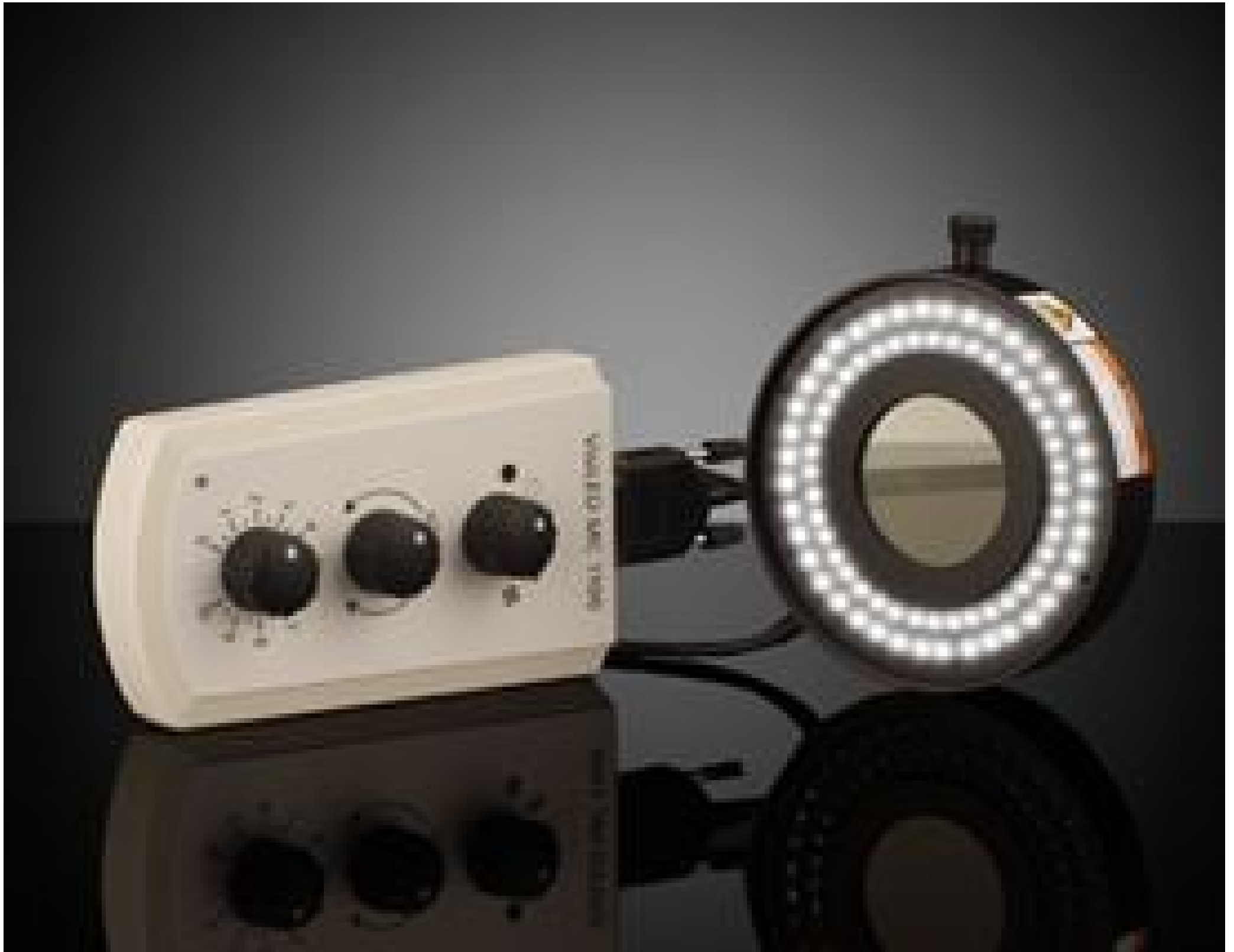
Ring light, controller & power supply required and sold separately.