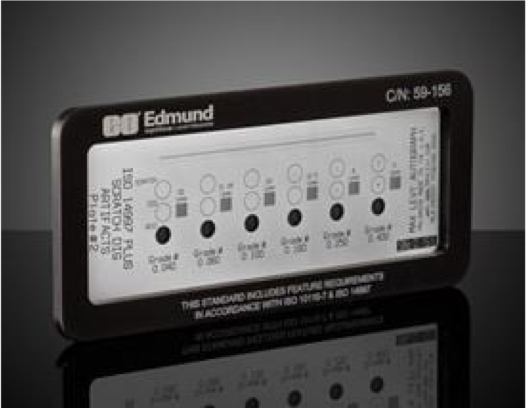
Scratch & Dig Target (1st Surface Negative), #59-156