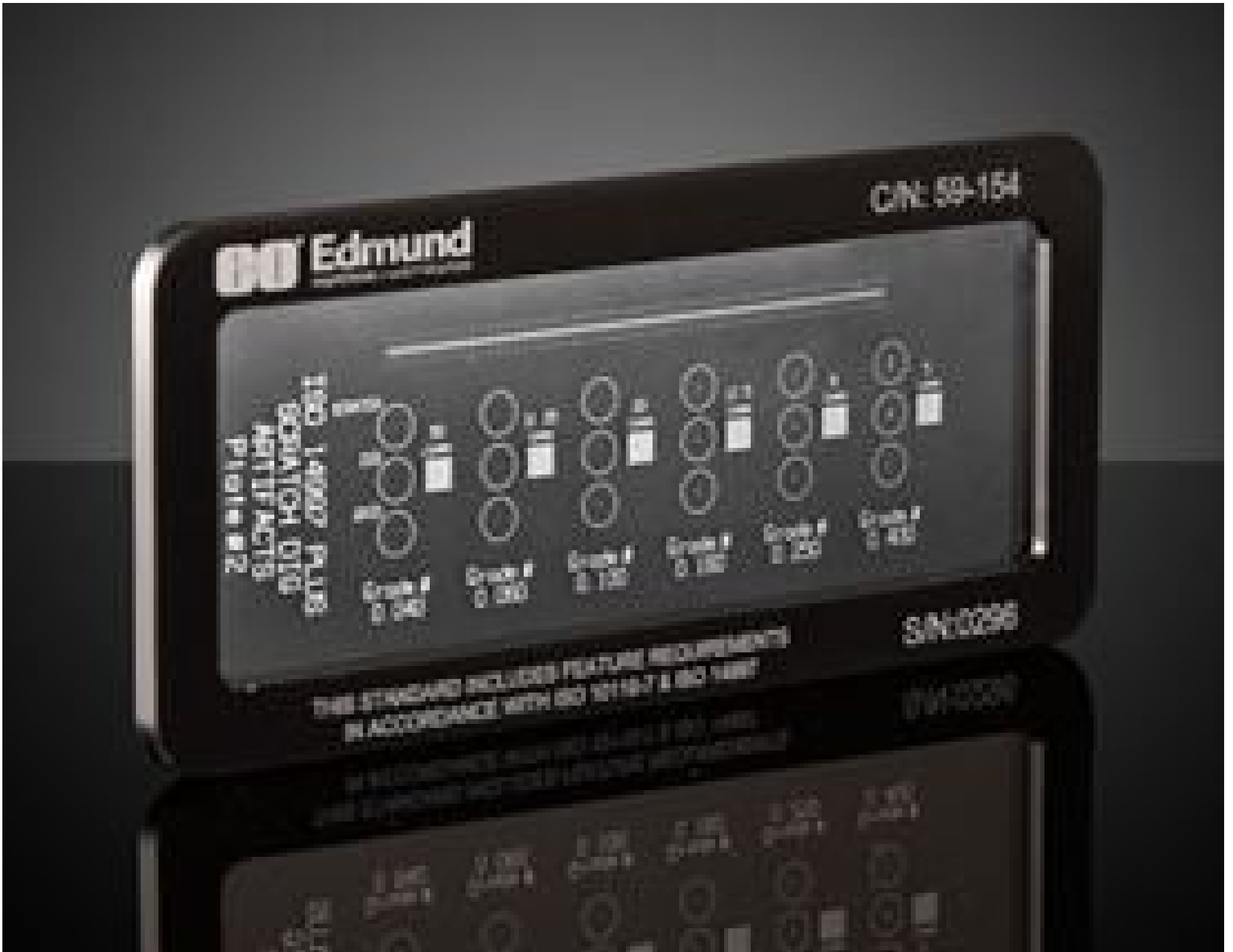
Scratch & Dig Target (1st Surface Positive), #59-154