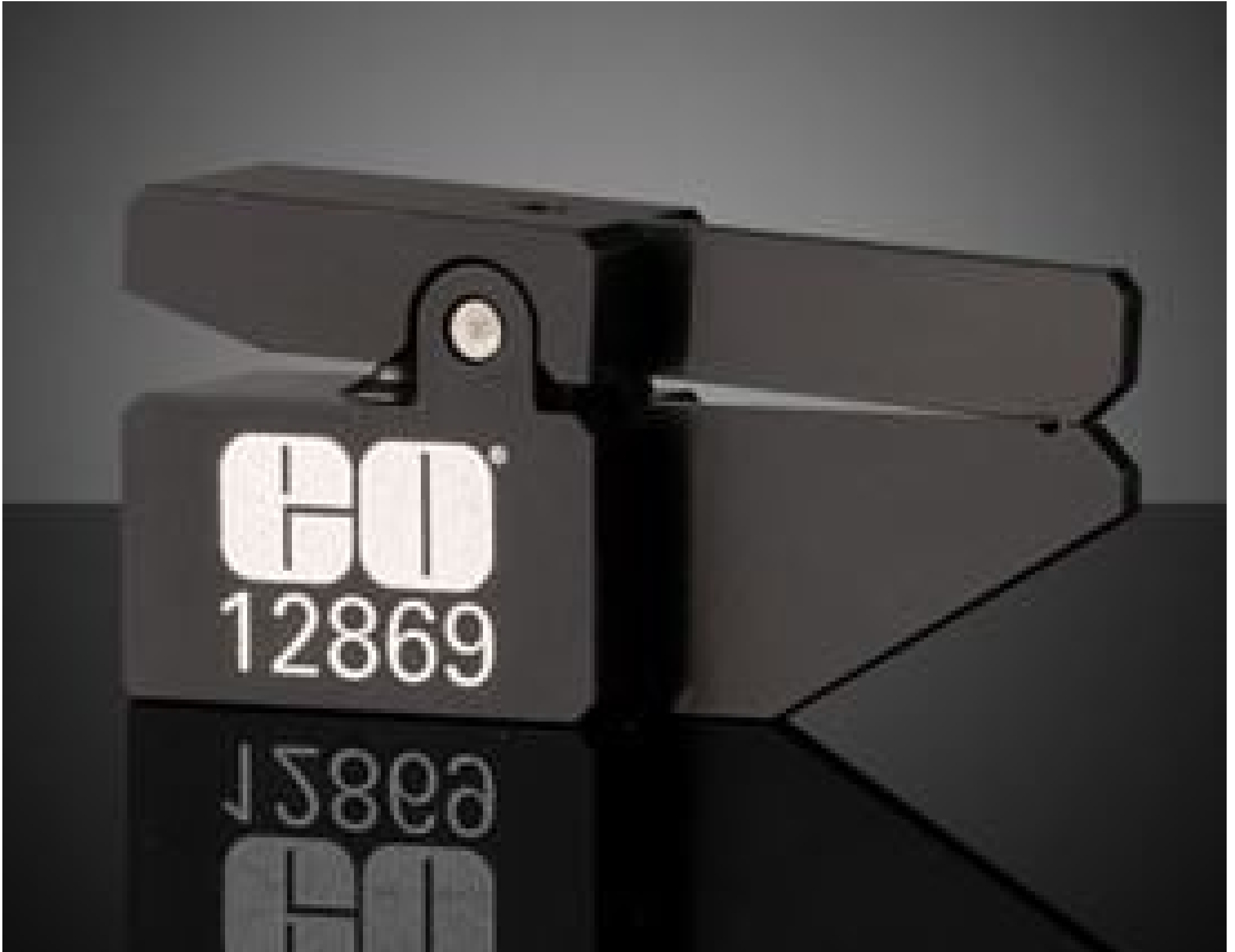
Small Lens Clamp for 1-3mm Dia. Optics, #12-869