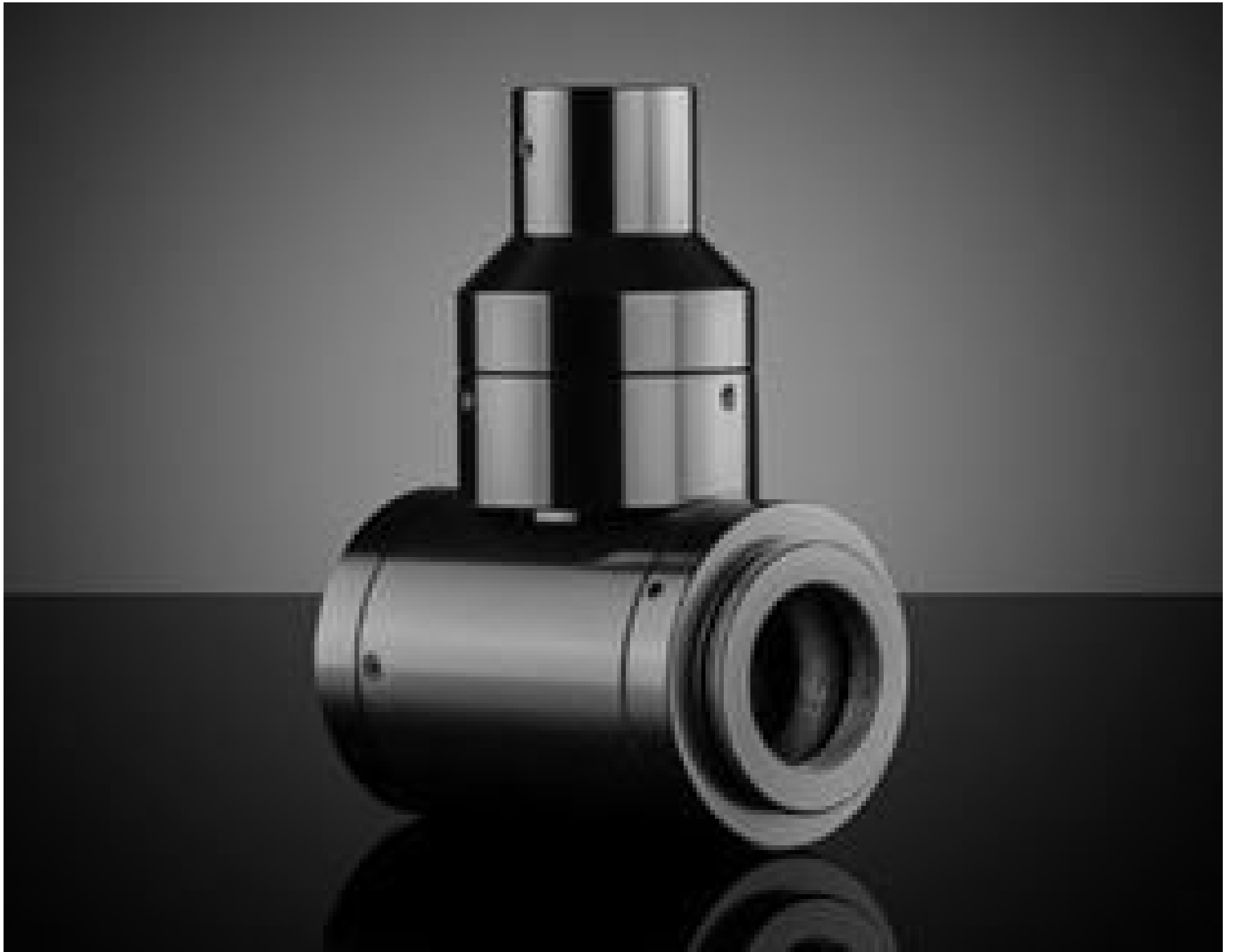
Standard In-Line Attachment (Optimized at 2X-10X), InfiniTube

See More by Infinity Photo-Optical Company