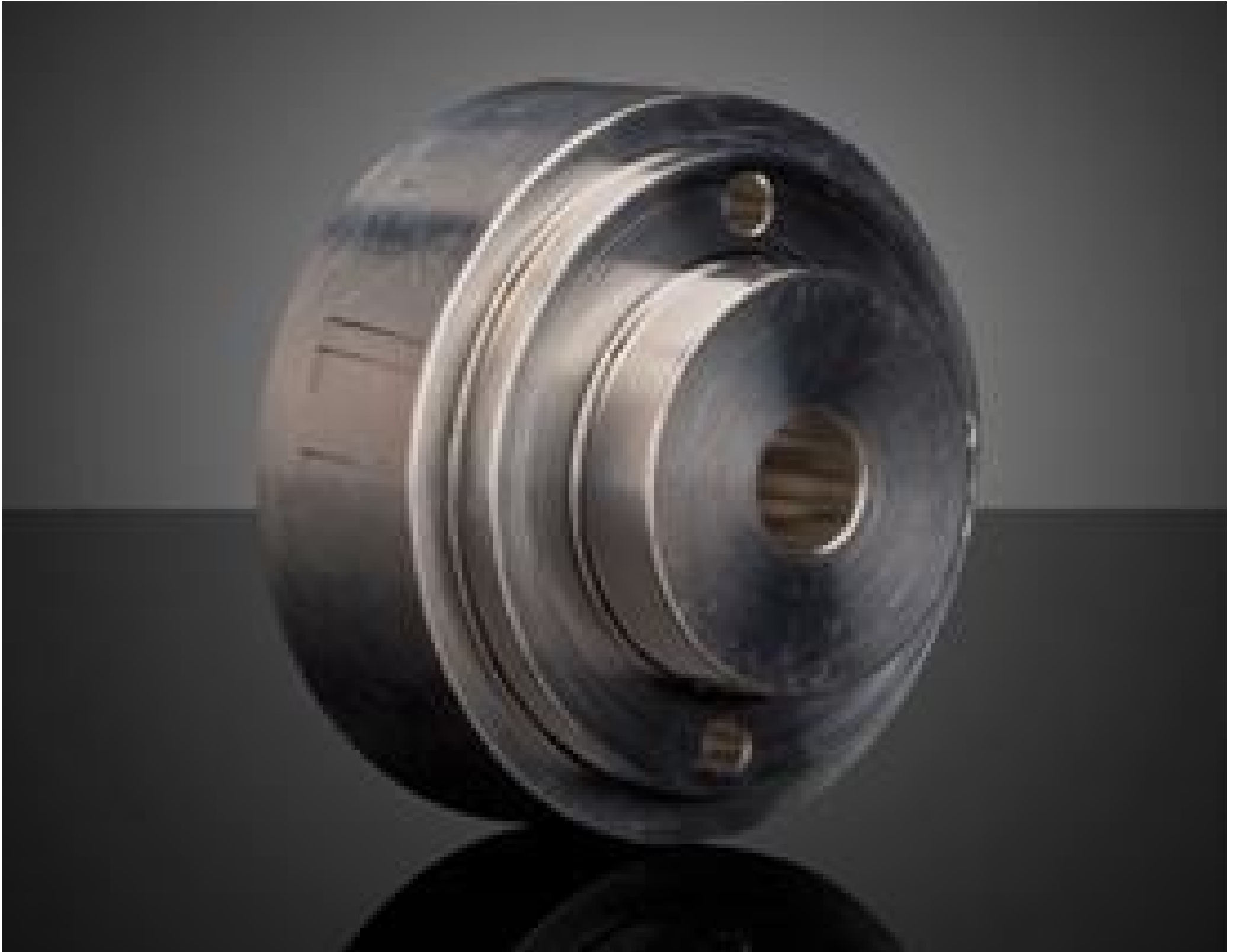
SugarCUBE™ Light Guide Adapter - 5mm (#13-537)