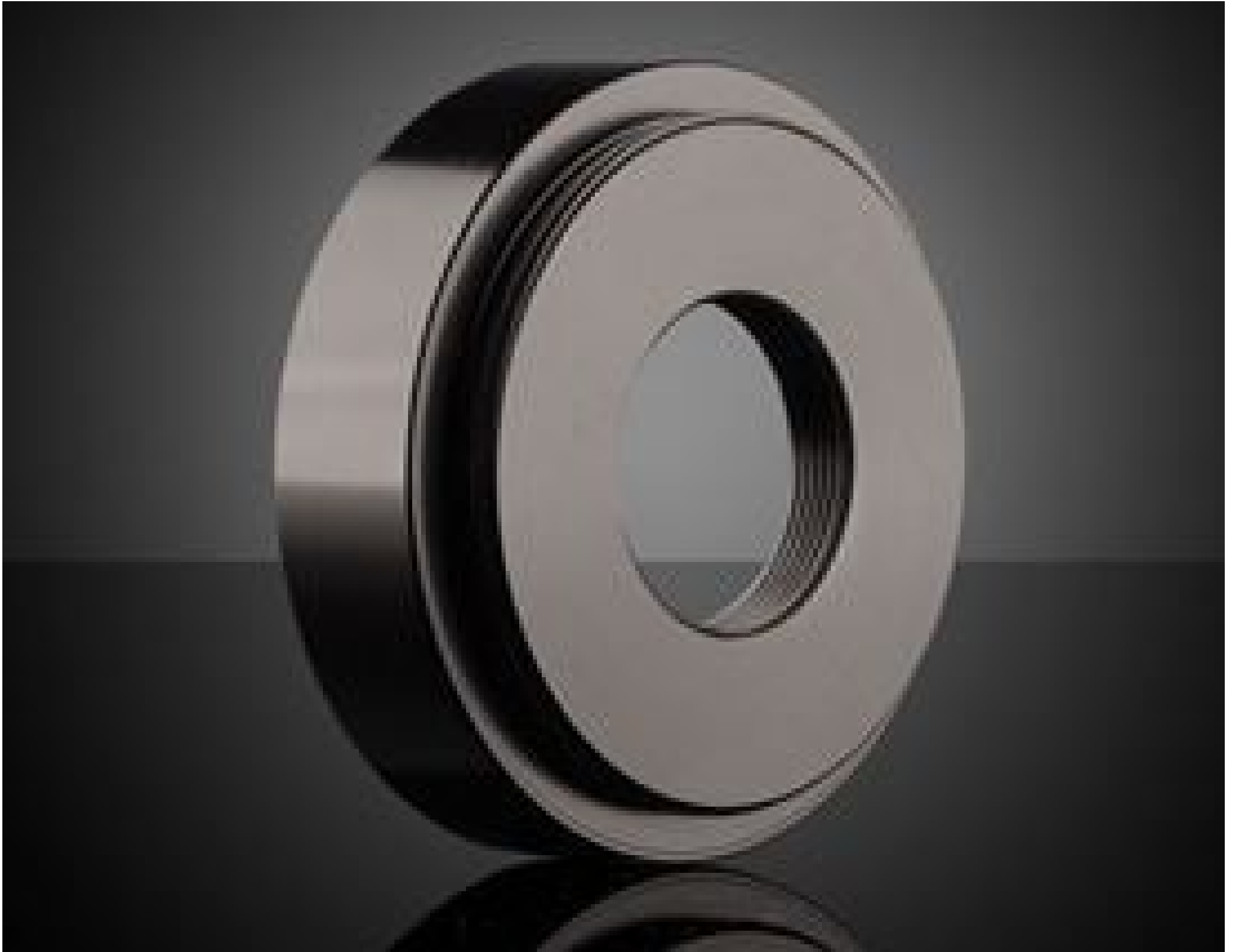
T-Mount Objective Ring Mount, #52-301