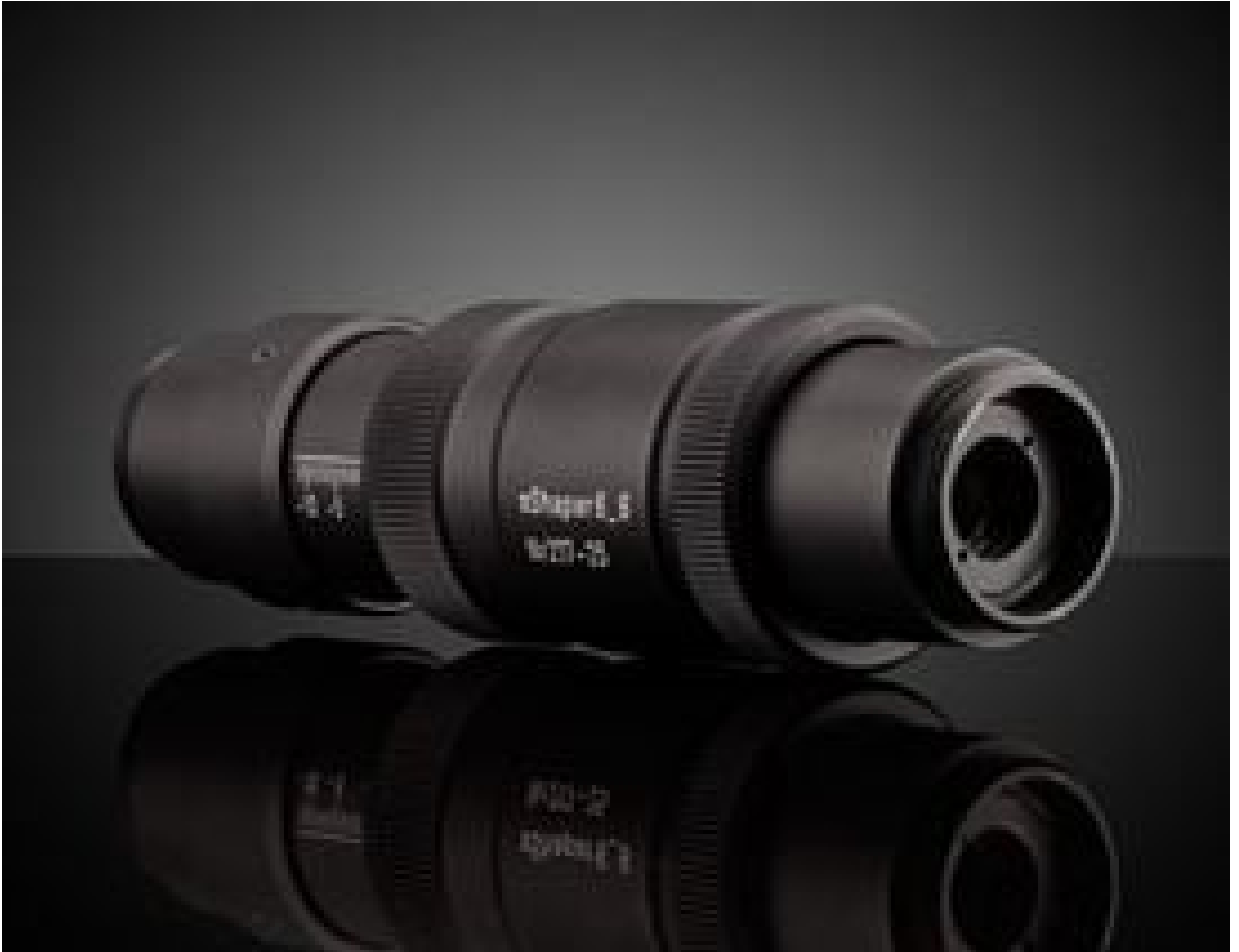
Ti:Sapphire Flat Top Beam Shaper, #36-649