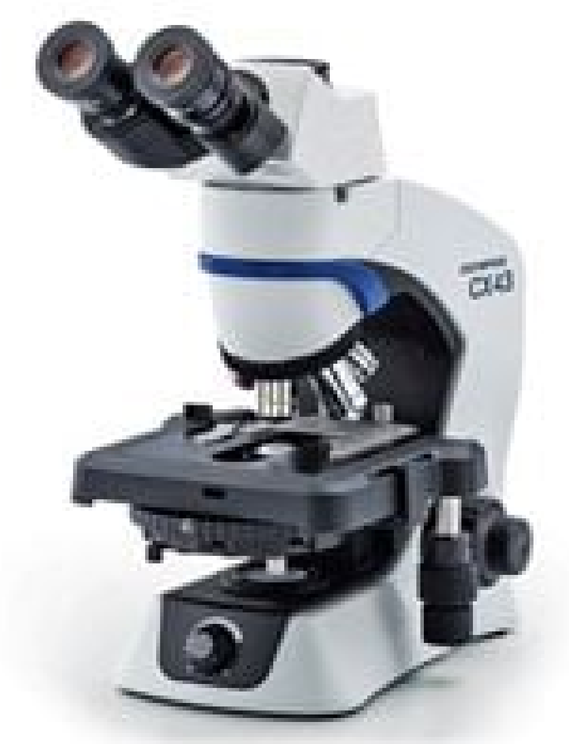
Image shown is full assembly. Each component sold separately. See Technical Information tab for additional details.