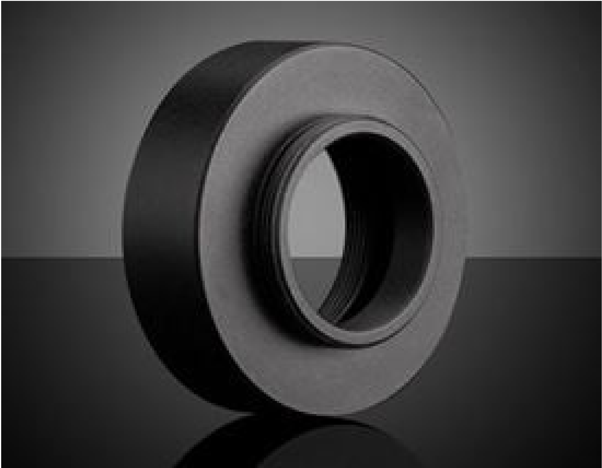
#34-237: Working Distance Spacer for #86-410